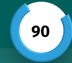
Participants are satisfied and going to attend next year